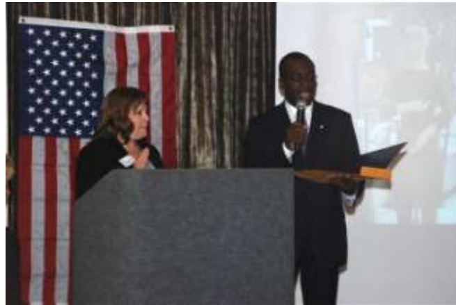
Buffalo Mayor Byron Brown Proclaiming IEA Day